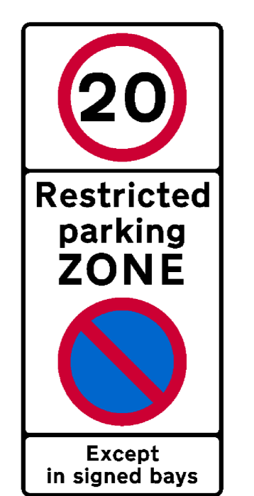
RPZ Entry sign

NB - After passing the RPZ Entry signs, waiting is permitted ONLY within signed bays.