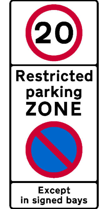
RPZ Entry sign

NB - After passing the RPZ Entry signs, waiting is permitted ONLY within signed bays.